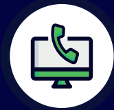
Telecoms and IT